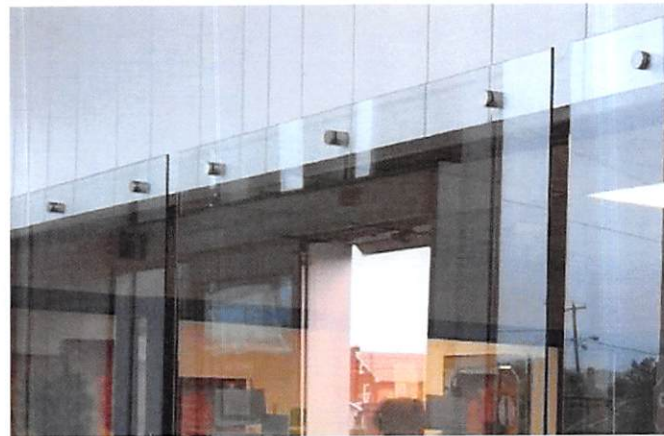
Figure 4: Example of point-supported glass barriers with thru-hole fittings.

An alternative mounting technique involves point-supported glazing, where glass panels are supported by through-hole or patch/clamp fittings. Typical hardware includes a bolt and patch plate system, a countersunk bolt, hardware with flexible washers and gaskets within the supporting structure, and hardware with articulated bolts. Refer to ASTM C1048 Standard Specification for Heat-Strengthened and Fully Tempered Flat Glass for requirements for fittings and hardware and placement of holes, notches and cutout fillets.