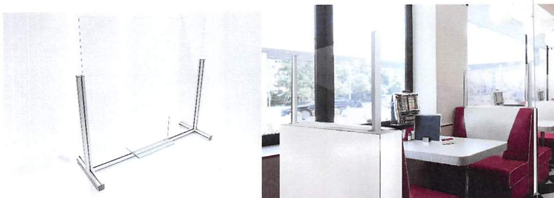
Figure 2: Examples of glass barriers mounted with edge clamping supporting two or more edges.

Edge clamps and adhesives are examples of simple and efficient ways to mount glass panels without designing and drilling holes into the glass. Using this technique, the mounting components should support the glass along a minimum of two edges and bite depth of the edge clamping over the glass edge should be appropriate for the glass thickness (see figure 3), as specified in the Glazing Manual and Laminated Glazing Reference Manual . Hardware is readily available for glass guards to support the weight of the glass panel without crushing or locally stressing the glass surface.