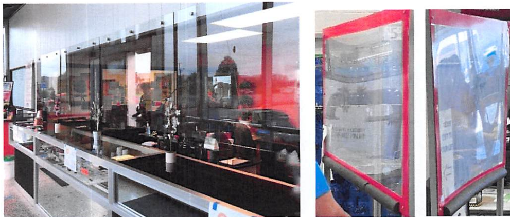
Figure 1: Safety glass installed for personal protective barriers (left photo) can provide a sleek, professional, sanitary, yet welcoming feel for consumers entering retail stores compared to plastic barriers (right photo) where rough edges and hazy distortion combined with surface scratches detract from the consumer experience and collect dirt and potentially bacteria.

Retail, medical, educational and manufacturing facilities are implementing changes due to the worldwide outbreak of COVID-19, a respiratory illness believed to spread primarily by droplets from coughs or sneezes of infected persons to those nearby. Many businesses are installing clear personal protective barriers to physically shield employees from each other and from consumers to reduce potential exposure to the virus. In many applications, the barriers will become a permanent fixture; therefore, aesthetics and cleanability are important design considerations. Barriers can be constructed of plastic sheet or glass. Glass has several advantages in physical barrier applications and may be preferred over plastic, especially for permanent and public-facing barrier installations. Compared to plastic, glass is easy-to-clean, transparent and aesthetically-pleasing.